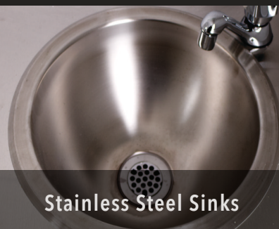
Stainless Steel Sinks