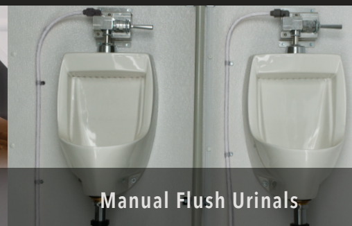
Manual Flush Urinals