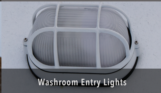
Washroom Entry Lights