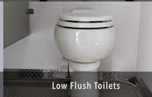
Low Flush Toilets